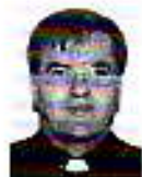
CHURCH OF THE HOLY SPIRIT DENNY'S CROSS, CORK.