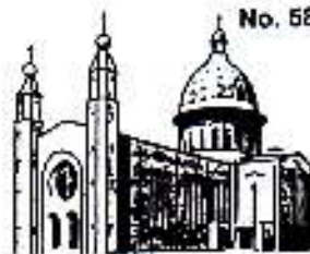
CHURCH OF THE HOLY SPIRIT DENMDY'S CROSS, CORK