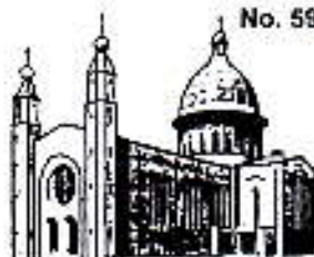
CHURCH OF THE HOLY SPIRIT DENNEHY'S CROSS, CORK