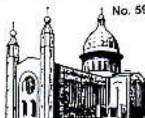
CHURCH OF THE HOLY SPIRIT DENNEHY'S CROSS, DORK