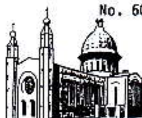
CHURCH OF THE HOLY SPIRIT DENEHY'S CROSS, COBK.