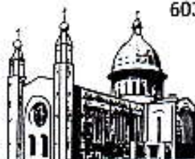
CHURCH OF THE HOLY SPIRIT DENNEHY'S CROSS, CORK.