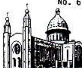
CHURCH OF THE HOLY SPIRIT DENNISHY'S CROSS, CORK.