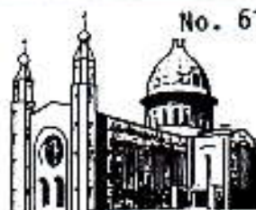
CHURCH OF THE HOLY SPIRIT DENNEHY'S CROSS, CORK.