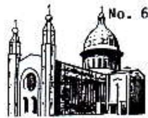
CHURCH OF THE HOLY SPIRIT DENNEHY'S CROSS, CORK.