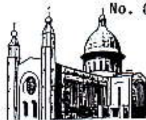
CHURCH OF THE HOLY SPIRIT DENBY'S CROSS, CO. WICK