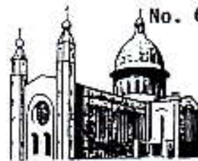
CHURCH OF THE HOLY SPIRIT DENMEY'S CROSS, CO. K.