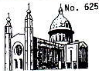
CHURCH OF THE HOLY SPIRIT DENNEHY'S CROSS, CORK