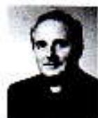
CHURCH OF THE HOLY SPIRIT DENNHY'S CROSS, DORK