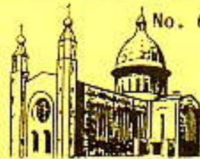
CHURCH OF THE HOLY SPIRIT DENNEHY'S CROSS, CO. K.