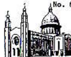
CHURCH OF THE HOLY SPIRIT BENEDICT'S CROSS, DORK