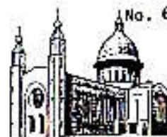
CHURCH OF THE HOLY SPIRIT DENNY'S CROSS, CORK