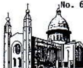
CHURCH OF THE HOLY SPIRIT DENEHY'S CROSS, CO. K.