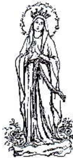
Our Lady of the Rosary pray for us