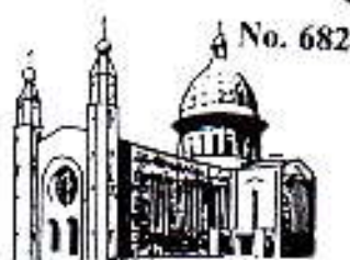
CHURCH OF THE HOLY SPIRIT DENNEHY'S CROSS, CORK