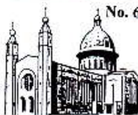
CHURCH OF THE HOLY SPIRIT DENEHY'S CROSS, CO. CK.