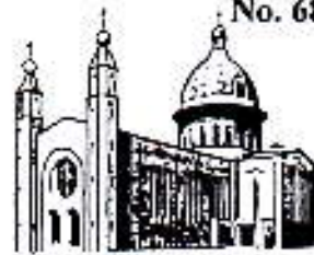
CHURCH OF THE HOLY SPIRIT DENNEY'S CROSS, CO. DK.