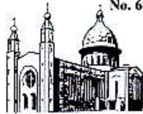
CHURCH OF THE HOLY SPIRIT DENNEHY'S CROSS, CO. DUB.