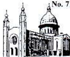
CHURCH OF THE HOLY SPIRIT KILMENNY'S CROSS, CORK