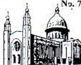
CHURCH OF THE HOLY SPIRIT DENNEHY'S CROSS, CORK