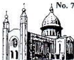
CHURCH OF THE HOLY SPIRIT DENBY'S CROSS, CORK.