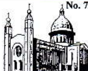
CHURCH OF THE HOLY SPIRIT DENNEHY'S CROSS, CORK