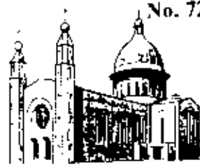
CHURCH OF THE HOLY SPIRIT KENNEFICKS CROSS, CORK