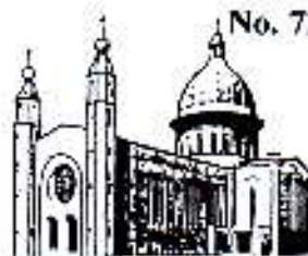
CHURCH OF THE HOLY SPIRIT DENNEHY & CROSS, COBK.