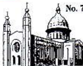
CHURCH OF THE HOLY SPIRIT DENNEHY'S CROSS, CORK.