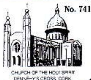
CHURCH OF THE HOLY SPIRIT DENNEHY'S CROSS, CORK