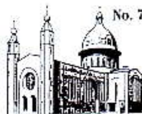
CHURCH OF THE HOLY SPIRIT DENNEY'S CROSS, COBK