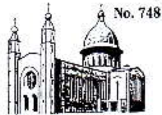
CHURCH OF THE HOLY SPIRIT DUNPHY'S CROSS, CORK.