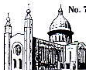
CHURCH OF THE HOLY SPIRIT DENNEHY'S CROSS, CO. CK