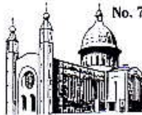
CHURCH OF THE HOLY SPIRIT DENNEHY'S CROSS, CO. DK.