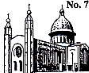
CHURCH OF THE HOLY SPIRIT DENNEHY'S CROSSES, CORK