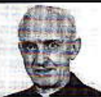
CHURCH OF THE HOLY SPIRIT DENNEHY'S CROSS, CORK.