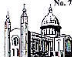
CHURCH OF THE HOLY SPIRIT DENNEHY'S CROSS, CORK