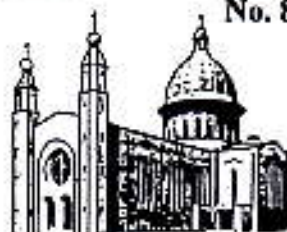
CHURCH OF THE HOLY SPIRIT DENNY'S CROSS, COAK.