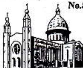
CHURCH OF THE HOLY SPIRIT CENNEHYS CROSS, CORK