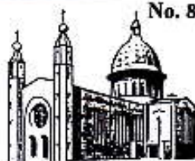
CHURCH OF THE HOLY SPIRIT DENNEHY'S CROSS, DUBLIN