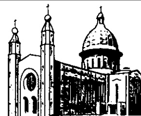
CHURCH OF THE HOLY SPIRIT DENNEHY'S CROSS, CORK