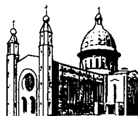
CHURCH OF THE HOLY SPIRIT DENNEHY'S CROSS, CORK