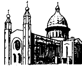
CHURCH OF THE HOLY SPIRIT DENNEHY'S CROSS, CORK