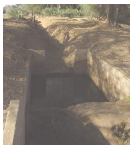
Canal crossing dug by the farmers