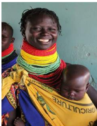
Food for young mothers and children