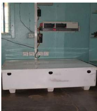
New Batteries to store the energy supplied by the solar panels

This year's campaign focuses on 3 urgent needs to help the communities in Turkwell.