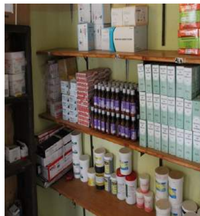
Medicines to guarantee good health to all the people in Turkwell parish